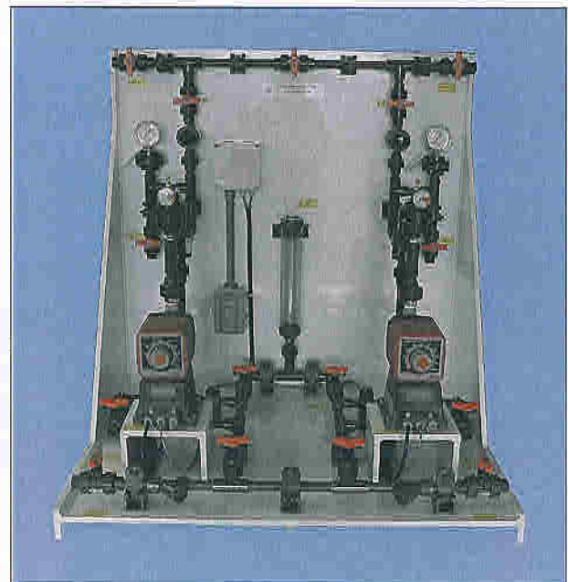
Duplex Metering Skid Featuring Walchem EHE Series Pumps

The pump skid is thermally welded PVC, completely corrosion resistant, and virtually maintenance free. Every chemical feed skid is designed with all the accessories required for your application, with special attention to materials of construction and piping design. All valves and accessories are clearly labeled for easy identification.