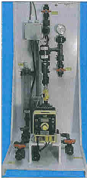
Simplex Metering Skid Featuring LMI C9 Series Pump

Installation time and expense is greatly reduced with the skid mounted package. Simply anchor the skid, connect the supply and discharge piping, complete the electrical wiring and you are completely up and running. The result is a professionally installed system that requires a minimal amount of floor space and is easy to operate and maintain.