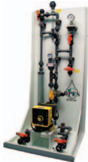
MS1 system in SCH-80 PVC shown with LMI Series 9 electronic metering pump.

BLUE PLANET ENVIRONMENTAL SYSTEMS, INC. is the industry leader in packaged chemical feed systems. With a wide selection of standard configurations, rapid development of custom systems, and plenty of options and accessories to choose from: there simply is no equal!